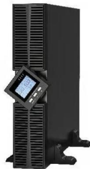
Display panel can be rotated