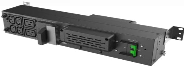
INNOVA Unity RT 6-10KVA MBP